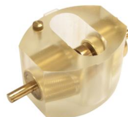
Test Cell: TCDE ASTM D877 (pictured left)