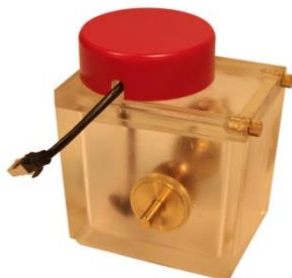
Test Cell: TCVDE ASTM D1816 (pictured left)